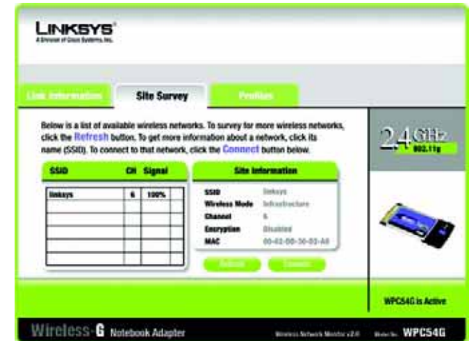
Figure 6-4: Site Survey

Connect - To connect to one of the networks on the list, select the wireless network, and click the Connect button.